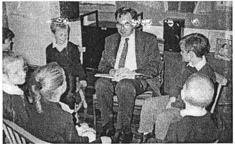
Middle school Head practises his reading during book week!