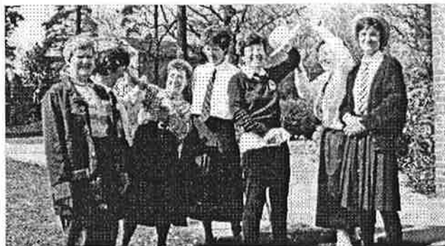
Prefects or rogues? Staff enjoy their uniform day

The Governors are most grateful to all the parents involved in the Cakwood Schools Association for all their fund-raising efforts throughout the year. The new fashion show venture proved a great success and altogether the OSA has raised 1350 for the school, allowing us to buy a cooker a colour printer and a CD player. The fete this year is on 19th June. Please give it your support.