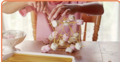
There are variety of ways to assemble a frame structure.