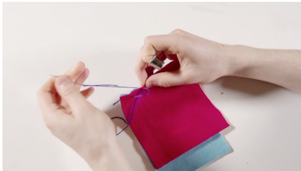
Sewing using a 'running stitch'.