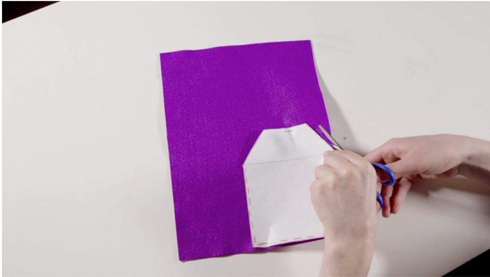
Using a template to cut the fabric into the correct shape.