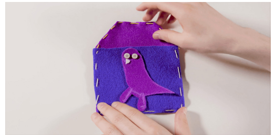
A finished pouch. Ready to evaluate.